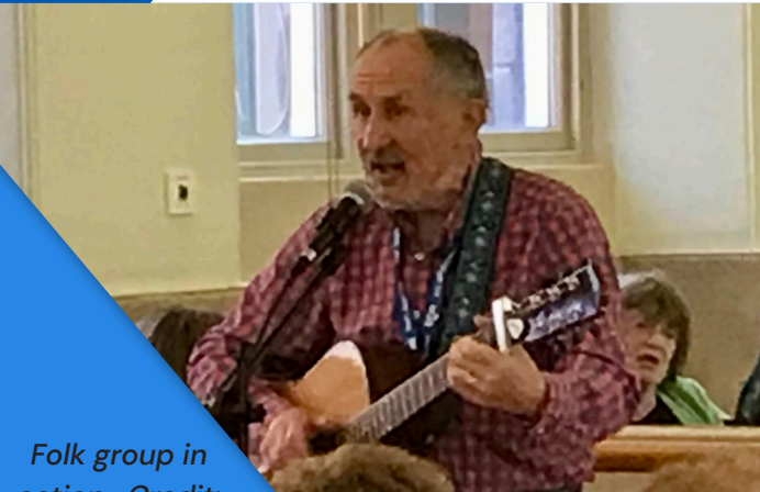
Folk group in action....