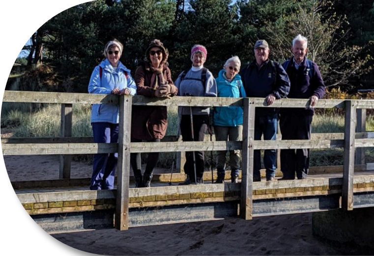
Intermediate Walkers on bench and bridge at Woodhall Nature Reserve...