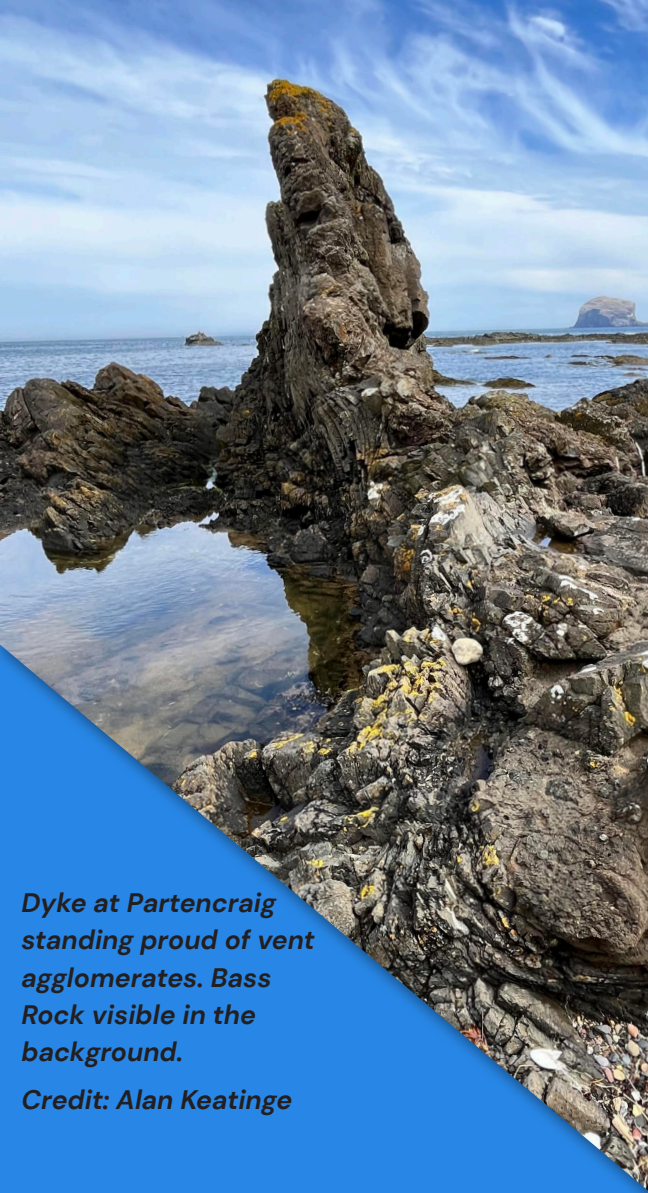
Dyke at Partencraig standing proud of vent agglomerates. Bass Rock visible in the background.

To find out more, contact the Group Leader at geology@eastlothianu3a.org.uk