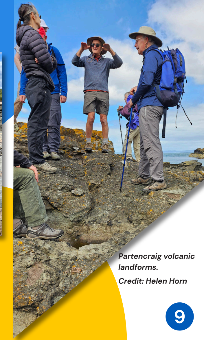
Partencraig volcanic landforms.