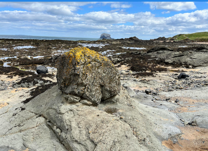
Partencraig lava bomb on softer tuff.